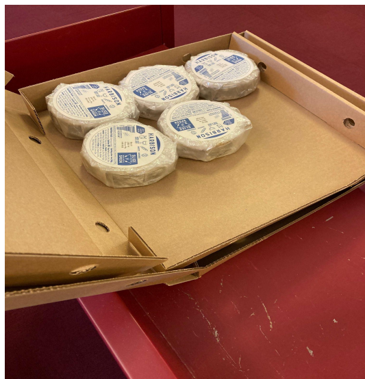
A cheesy ending to a fun day!