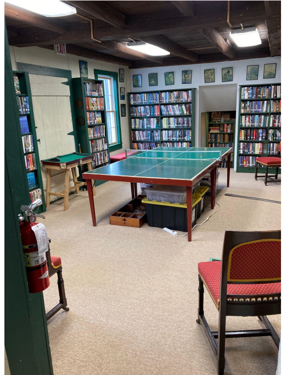
The Simpson Memorial Library is part museum and part library ...and they have a ping pong table in one of their rooms!