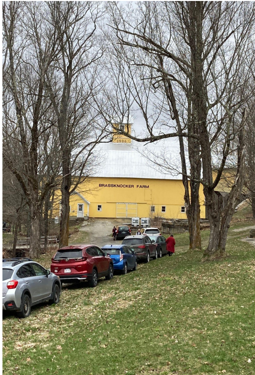
Brassknocker Farm, next door to the Simpson Memorial Library in East Craftsbury.