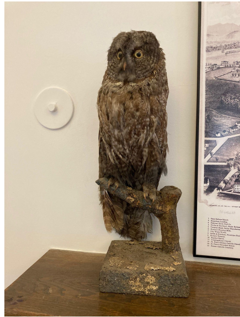
“WHOOO likes the Bixby??”