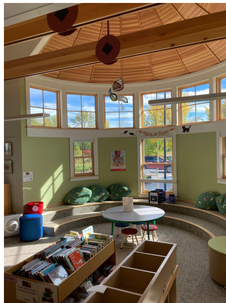
The Charlotte Library has a new addition which includes a gorgeous, light-filled children's area.