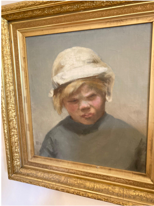
This youngster doesn't look too thrilled about being on the wall at the Bixby Memorial Library...