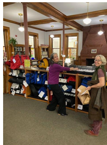
Clowning around in St. Albans