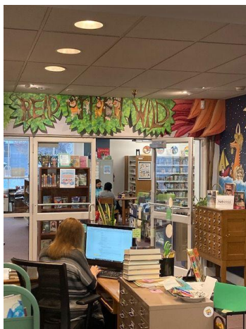
Swanton's new mural