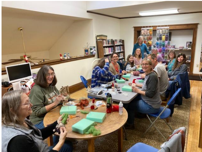
Needle felters, doing their thing and having fun!