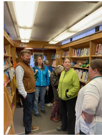
Inside Figgy the Bookmobile!