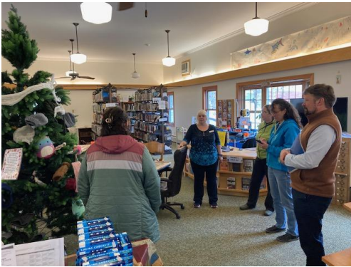
Starting out in Enosburgh...