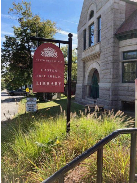
The sign outside the "other" Haston floor