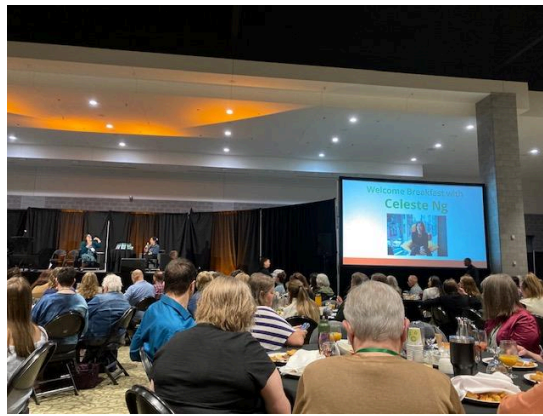
Celebrated author Celeste Ng gave the keynote address on the first day of the conference.