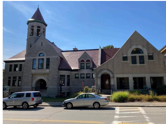
Street view (it's a bit larger than our