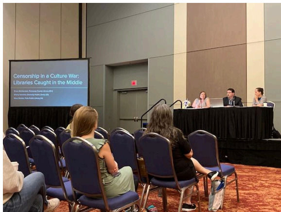
These three librarians, from Idaho, Ohio, and Iowa, have courageously served their communities in the face of many challenges. Their stories were really inspiring.