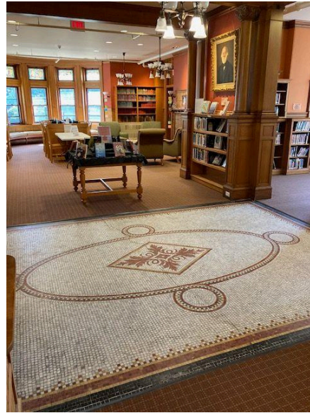
Some beautiful tile work on the main floor