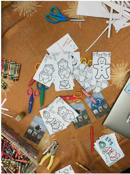
Crafty cards, courtesy of Canva! ghosts!