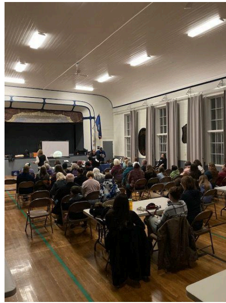
Around 70 “souls” came out to look for