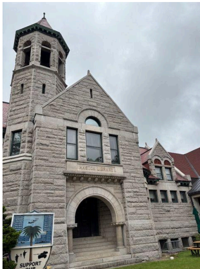
Haston Free Public Library