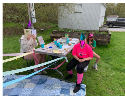
The grade school book club was a Winn-Winn!