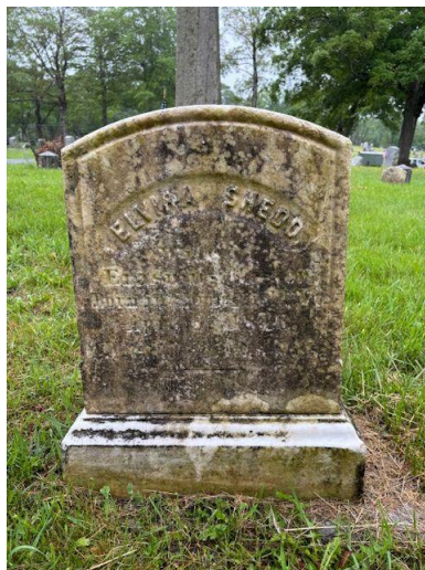
Elvira (Shedd) Haston's gravestone. Next time, we'll bring some cleaning supplies.