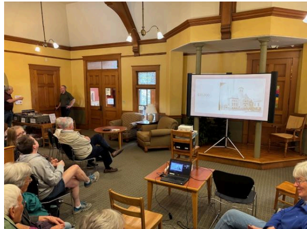
There was a great turnout for "A Tale of Two Libraries"!