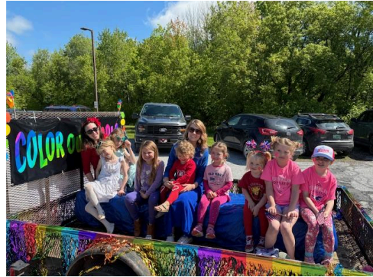
A float full of book lovers for Memorial Day!