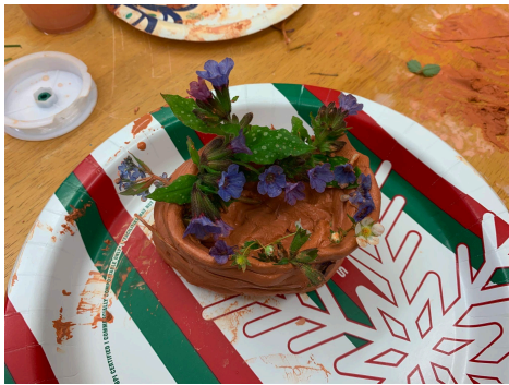
Now that is one beautiful pinch pot!!